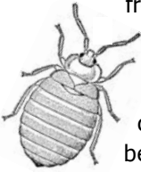
Female Bed Bug

Bed bugs are often unknowingly transported to new locations, but they can also independently crawl off by themselves from room to room and apartment to apartment. It is believed that they prefer to remain in the same area, close to each other and where they can get a blood meal—unless they become overcrowded or their food source disappears.